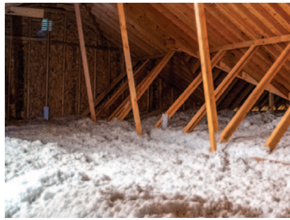
During any project that takes you into the attic, check insulation levels.

A little planning during a remodel can go a long way toward improving your home's energy efficiency. Remember: it's more difficult and more expensive to go back and tackle energy efficiency projects after your space is finished.