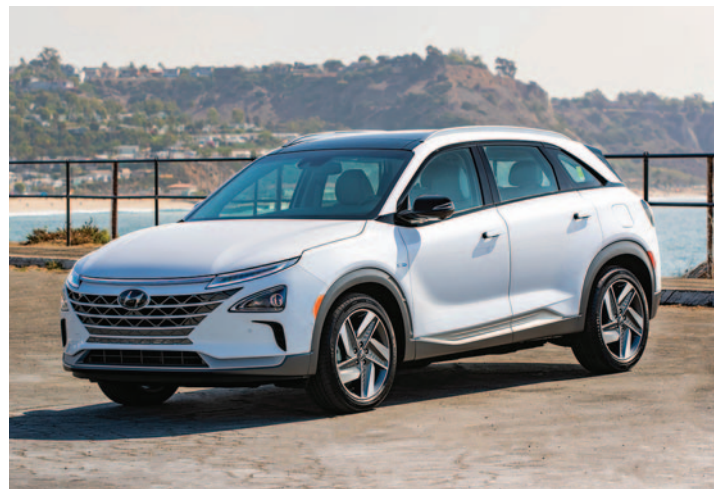
One of the newest alternative ways to power a vehicle is with hydrogen in the form of a fuel cell. The Hyundai NEXO shown here is hydrogen-fueled.

There is great potential to see these alternative fuels expand over the years, and additional research efforts may help these fuels reach more individual consumers nationwide.