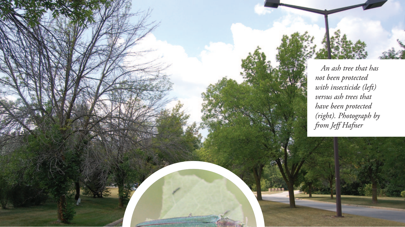
An ash tree that has not been protected with insecticide (left) versus ash trees that have been protected (right).