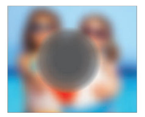
A scene as it might be viewed by a person with age-related macular degeneration

And Allows Many Low Vision Patients To Drive Again